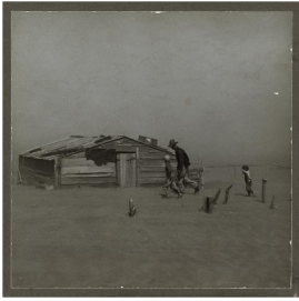
Farmer and sons walking in the face of a dust storm. Cimarron County, Oklahoma [1936]

http://www.loc.gov/pictures/item/fsa1998018983/PP/