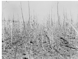
Corn, drought-stricken and eaten off by grasshoppers. Near Russelville, Arkansas [1936]

http://memory.loc.gov/cgi-bin/query/r?ammem/fsaall:@field(NUMBER+@band(fsa+8b38287))