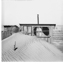
Sand piled up in front of outhouse on farm. Cimarron County, Oklahoma [1936]

http://www.loc.gov/pictures/item/fsa1998018983/PP/