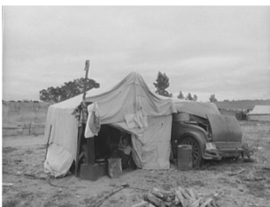
Pea picker's home. The condition of these people warrant resettlement camps for migrant agricultural workers. Nipomo, California [1936]

http://memory.loc.gov/cgi-bin/query/r?ammem/fsaall:@field(NUMBER+@band(fsa+8b15322))