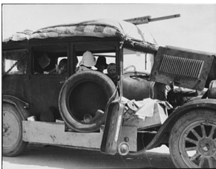
Migrant drought refugee family stalled on an Arizona highway, between Yuma and Phoenix, on their way to California to work in the harvests [1937]

http://memory.loc.gov/cgi-bin/query/r?ammem/fsaall:@field(NUMBER+@band(cph+3c30705))