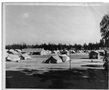
Migrant camp, wide shot [no date]

http://memory.loc.gov/cgi-bin/query/r?ammem/toddbib:@field(DOCID+@lit(p008))