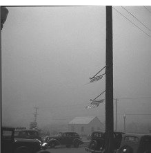
Dust storm. Note heavy metal signs blown out by wind. Amarillo, Texas [1936]

http://memory.loc.gov/cgi-bin/query/r?ammem/fsaall:@field(NUMBER+@band(fsa+8b26998))