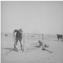
Dust bowl farmer raising fence to keep it from being buried under drifting sand. Cimarron County, Oklahoma [1936]

http://memory.loc.gov/cgi-bin/query/r?ammem/fsaall:@field(NUMBER+@band(fsa+8b38341))