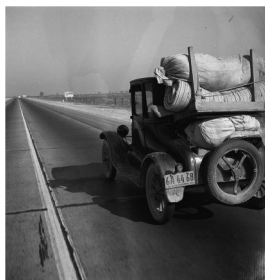
Drought refugee's car on U.S. Highway 99 between Bakersfield and Famoso, California. Note: the photographer passed twenty-eight cars of this type (drought refugees) between Bakersfield and Famoso, thirty-five miles, between 9:00 and 9:45 in the morning [1936]

http://memory.loc.gov/cgi-bin/query/r?ammem/fsaall:@field(NUMBER+@band(fsa+8a11640))