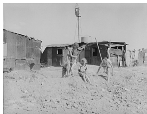
Housing for migratory cotton laborers near Casa Grande, Arizona [1937]

http://memory.loc.gov/cgi-bin/query/r?ammem/fsaall:@field(NUMBER+@band(fsa+8b31908))