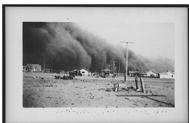
Dust storm. Baca County, Colorado [1936?]

http://memory.loc.gov/cgi-bin/query/r?ammem/toddbib:@field(DOCID+@lit(p009))