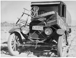
Car of drought refugee on edge of carrot field in the Coachella Valley. California [1937]

http://memory.loc.gov/cgi-bin/query/r?ammem/fsaall:@field(NUMBER+@band(fsa+8b31848))