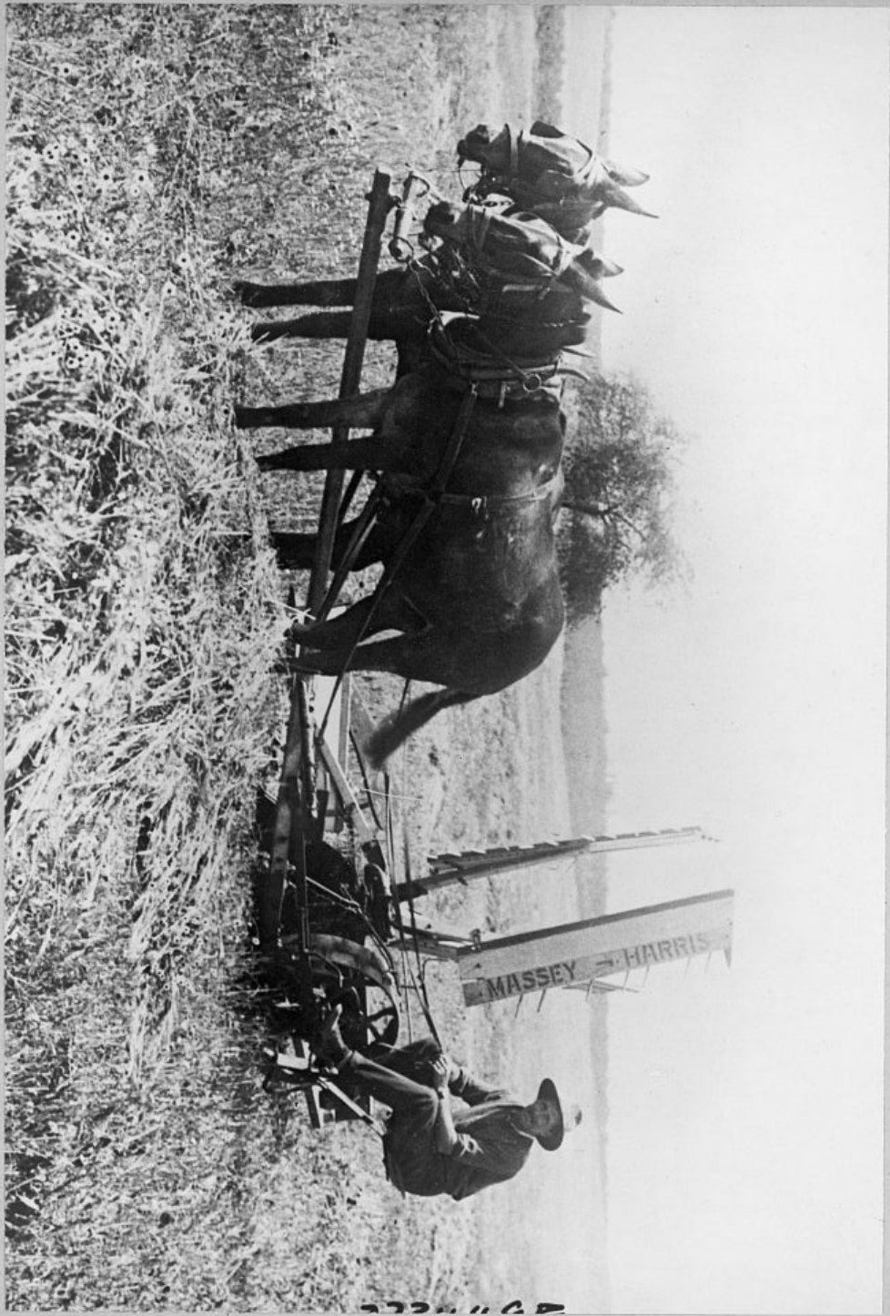
"Palestine, Jewish farmer with modern machinery" [Israel]

http://www.loc.gov/pictures/item/2003652908/