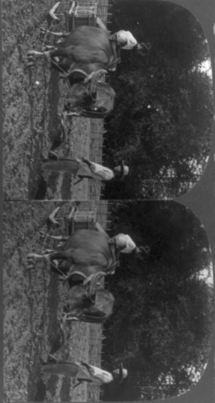
772—A Ploughing Scene near Manila, Philippines.