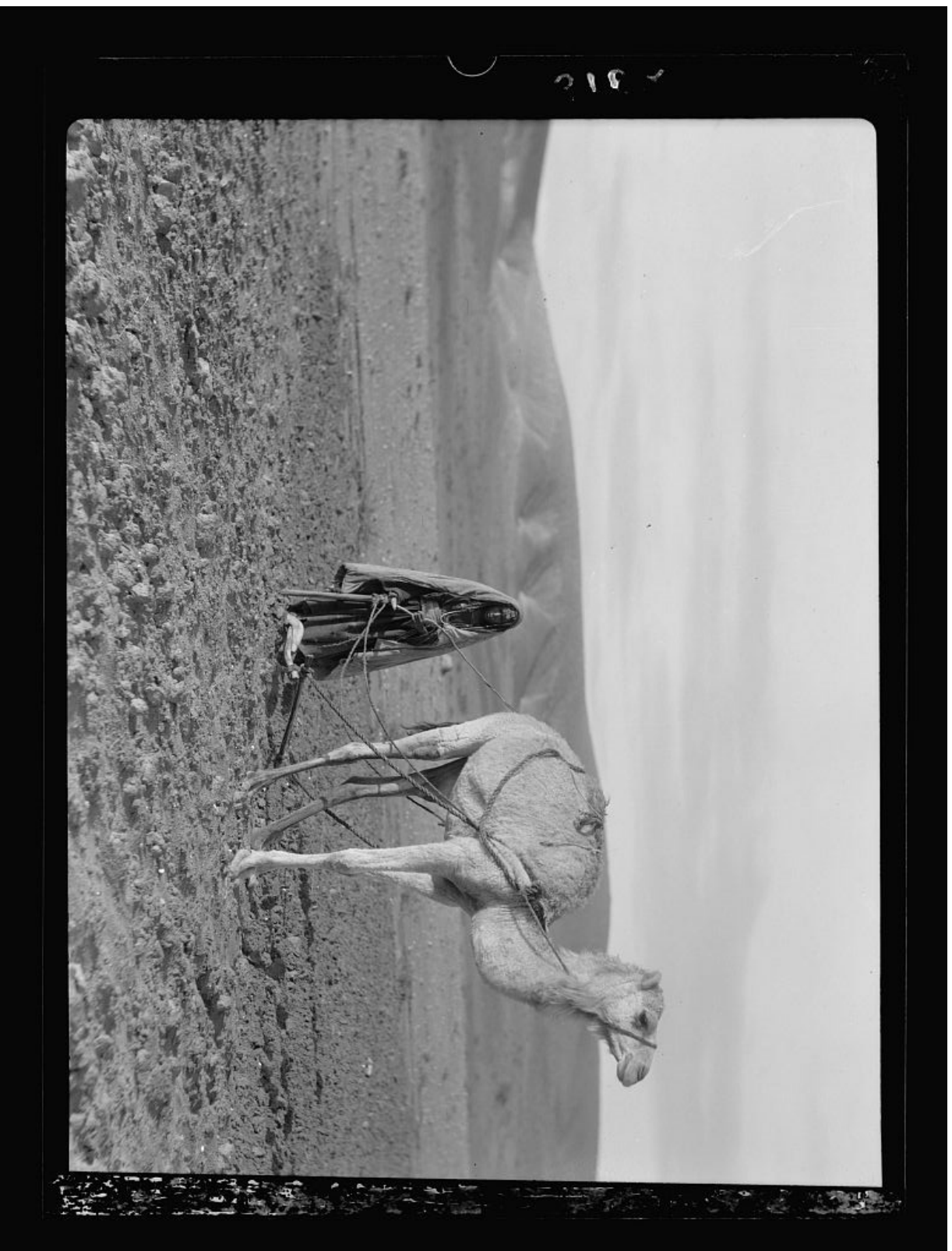
“Beersheba and surroundings. (Beer Saba). Beersheba. Beduin women ploughing, with a carnel” [Israel]