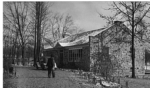
Skyline Farms store, Alabama (1937)