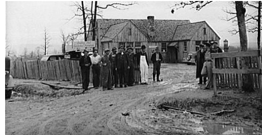
Trading post at Cumberland Homesteads, Crossville, Tennessee (1936)

What can you learn about life in Cumberland Homesteads and Skyline Farms from comparing, contrasting, and analyzing photographs of the communities, and how were photographs and posters used as propaganda in the 1930s?