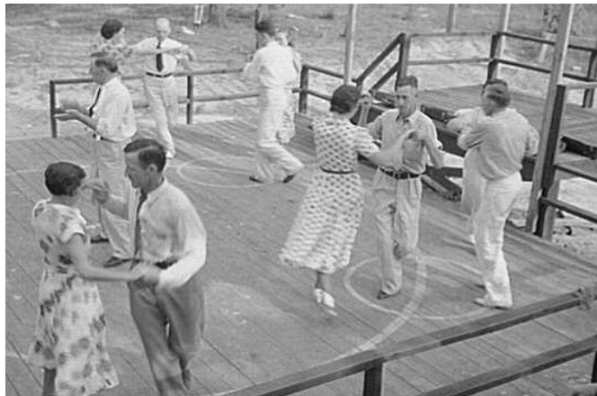
Square dance, Skyline Farms, Alabama [1937]