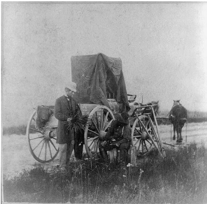
A rare specimen found on hill above Fort Riley, Kansas, 420 miles west of St. Louis, Mo. [1867]