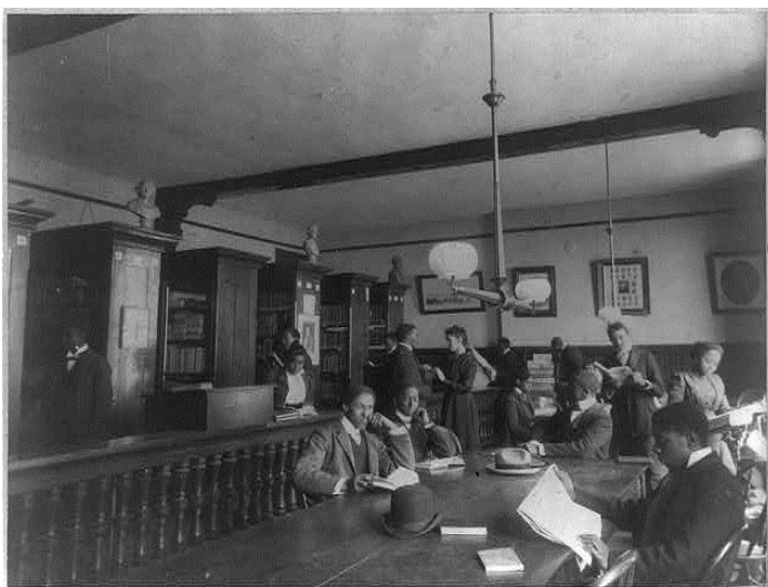
Fisk University, Nashville, Tenn., 1900 - library interior [1900?]