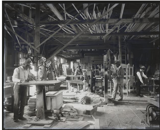
[ Wood workshop at Tuskegee Institute, ca. 1902 ]

How did the competing educational philosophies of DuBois and Washington address the needs of African-Americans during the Jim Crow period?