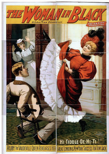
The woman in black by H. Grattan Donnelly . [1896]