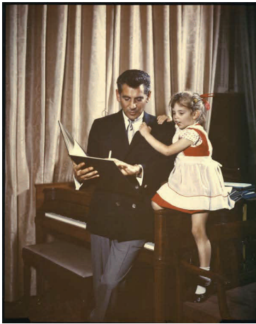
Bernstein with daughter Jamie, 1957.

Leonard Bernstein, famous composer of West Side Story , was one of the first music professionals in the United States to promote American music as being just as worthy of appreciation as European music. Before him, so-called experts determined that proper musical education for Americans – and children in particular – must consist only of well-known European classical composers such as Beethoven and Mozart.