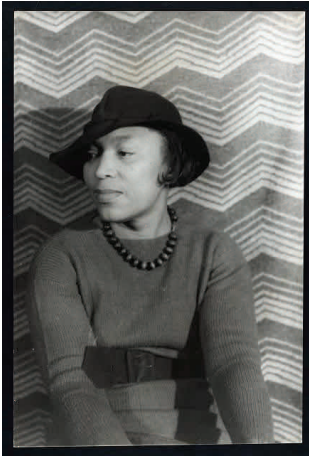
[Portrait of Zora Neale Hurston]. [1938 Apr. 3]

African American writer, folklorist, and anthropologist Zora Neale Hurston (1891-1960) is best known for her novel Their Eyes Were Watching God (1937) and her autobiography Dust Tracks on a Road (1948). She also wrote plays, several of which were rediscovered in 1997 and housed in a collection at the Library of Congress. Most of Hurston's plays never appeared on stage, but in 1932-33 she produced The Great Day in New York City to critical acclaim. In 1935, she joined the Harlem, New York, unit of the Federal Theater Project, a New Deal program.