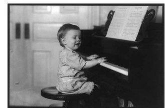
The Virtuoso c1912