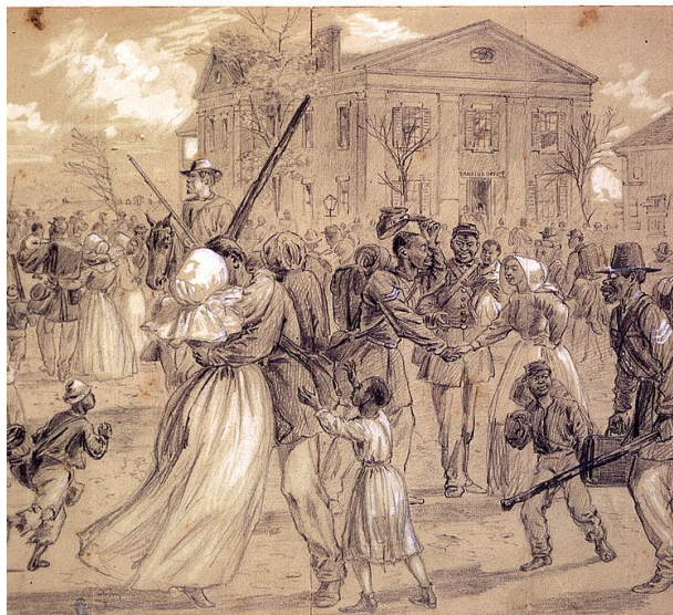
African American soldiers mustered out at Little Rock, Arkansas [1866; detail]