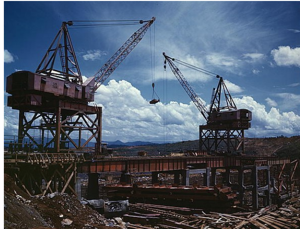
Construction work at the TVA's Douglas Dam, Tenn. [1942]

http://memory.loc.gov/ammem/fsowhome.html