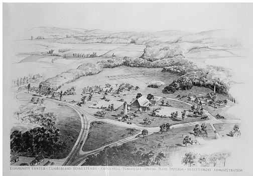
Cumberland Homesteads, Crossville, Tennessee. [between 1935 and 1942]