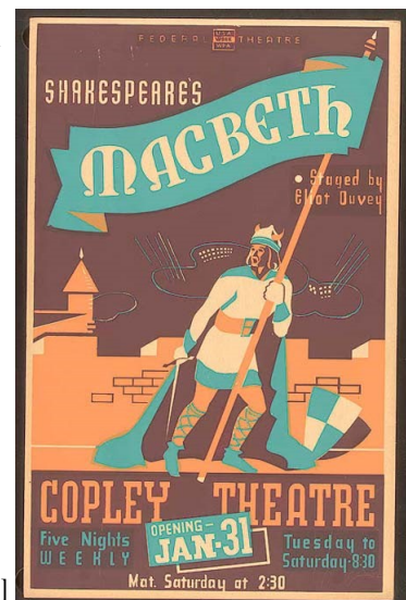
Macbeth Poster [ 1939]